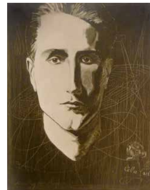
Man Ray. Cela vit , c. 1923 Silver gelatin 20 x 16 cm Collection Fundació Vallpalou, Lleida

Picabia, after a cubist and futurist pictorial period, led the Dada movement and published magazines such as Cannibale (1920) and collaborated with his drawings in the magazine Littérature, nouvelle série , directed by André Breton from 1922 to 1924. In 1917 he published the first issue of the Dada magazine 391 in Barcelona. The cover is a machine that titled NOVIA [Bride]. In 1922 he exhibited in the Dalmau galleries of Barcelona an exhibition of Máquinas y Españolas [Machines and Spanish Women] and the catalog includes a preface by André Breton.