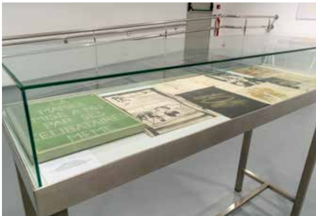
Marcel Duchamp. La Mariée mise à nu par ses célibataires / Green Box , 1934 Collection Fundació Vallpalou, Lleida

In 1913, Duchamp's Nude Descending a Staircase , which had been exhibited in the Dalmau galleries of Barcelona a year earlier at the Cubist Art Exhibition, had been a success in the Armory Show in New York. Man Ray and Duchamp met in New York in 1915, met with the photographer Alfred Stieglitz,